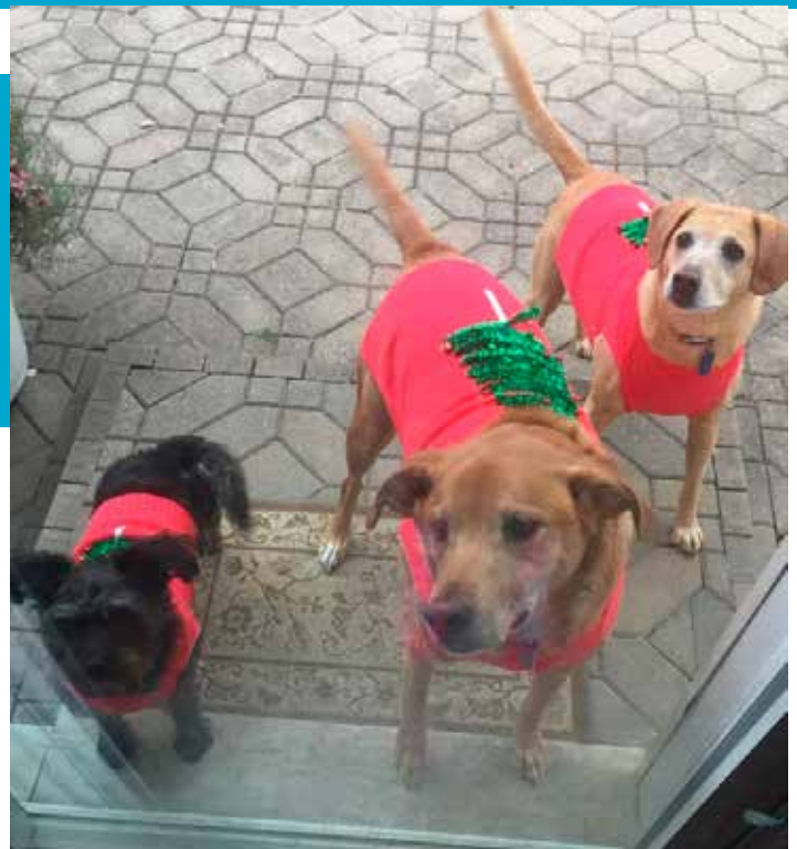
Lackman Dogs, Baxter, Carson and Bailey